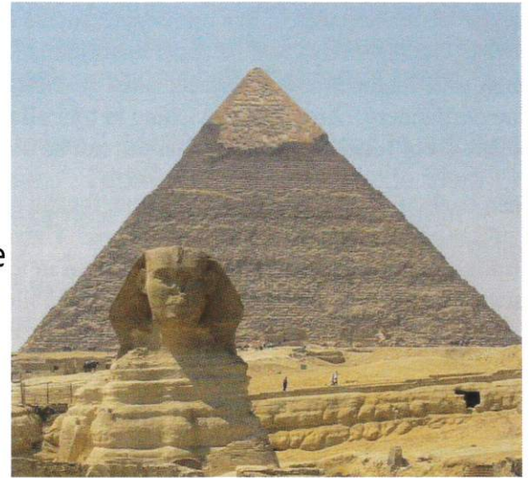
See the Pyramids along the Nile